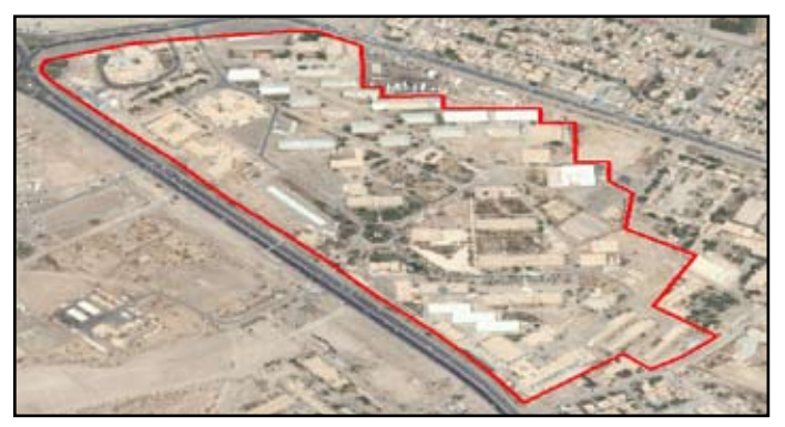
Fig.1: the area of the case study (MTU)

The area of study is the Middle Technical University (MTU) that's located in Baghdad/Zaafaraniya as illustrated in Fig.1 , which is going under quite deal of developments in many sectors and any surveying work that goes in it will be very lucrative for any future expansion the university will go under.